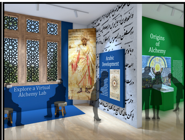
Above and on back cover - artist renderings of the New Alchemy Museum at Rosicrucian Park.